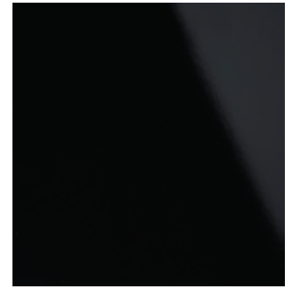
Black Reflective Porcelain Liner