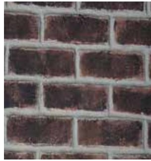
Vintage Ceramic Fiber Liner