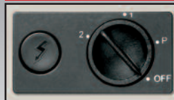
SC10M MANUAL CONTROL

Manual Control Top mounted for convenient and easy operation without requiring any electricity