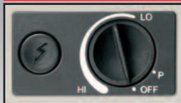
SC10T THERMOSTAT CONTROL

Thermostat Control Allows operation at preset temperature without requiring any electricity