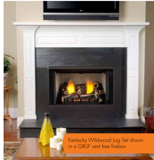
Kentucky Wildwood log Set shown in a GRUF vent free firebox

We recommend installing this log set in a Monessen firebox. Talk with your dealer about your options!