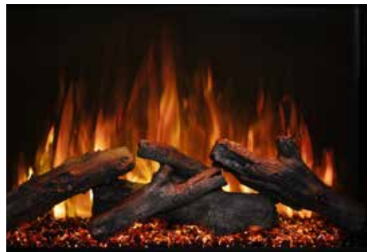
Orange Flames - Logs off