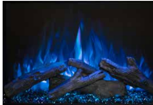
Blue Flames - Logs off