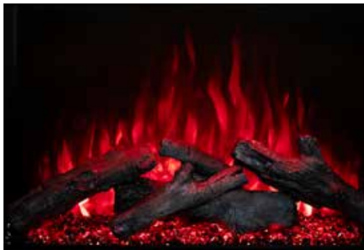
Red Flames - Logs off