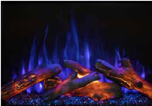
Blue Flames - Logs on

Flame & Ember Bed Colors Controlled Independently