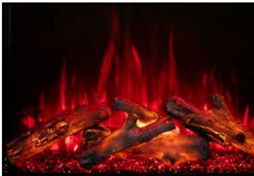
Red Flames - Logs on