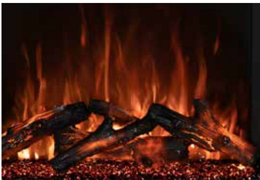
Orange Flames - Logs on