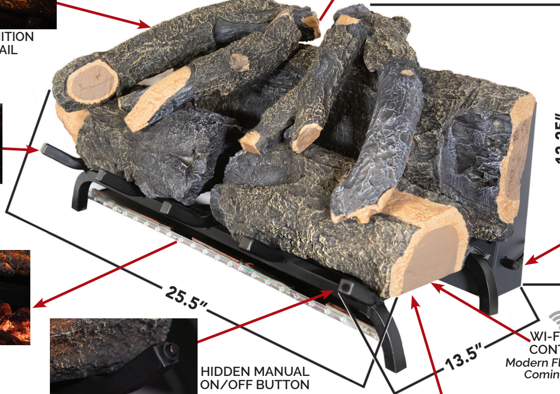
WI-FI APP CONTROL Modern Flames App Coming Soon