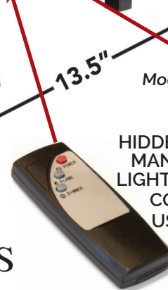
HIDDEN UNDER LOG MANUAL 6 STAGE LIGHTING INTENSITY CONTROL OR USE REMOTE