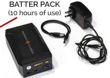
OPTIONAL LITHIUM ION BATTERY PACK (10 hours of use)