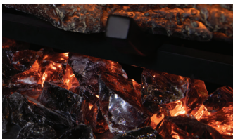
REALISTIC EMBER BED WITH GLASS