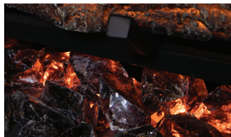
REALISTIC EMBER BED WITH GLASS