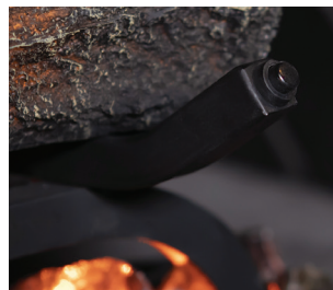
HIDDEN MANUAL ON/OFF BUTTON