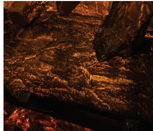
HIGH DEFINITION LOG DETAIL