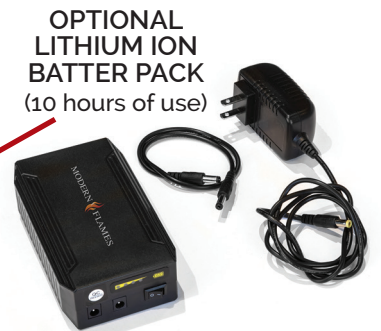
OPTIONAL LITHIUM ION BATTERY PACK (10 hours of use)