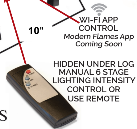
WI-FI APP CONTROL Modern Flames App Coming Soon