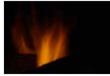
Reflective Black Glass (single-sided only)