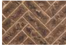
Tavern Brown Herringbone (single-sided only)