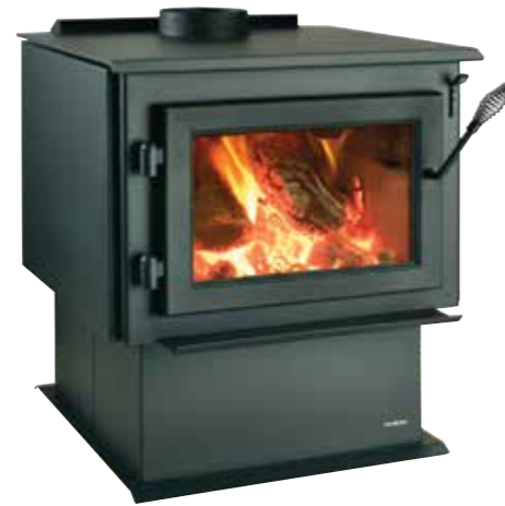
WS18 wood-burning stove

Manufactured in the USA, by the world's leading hearth company since 1927—known for value and dependability.