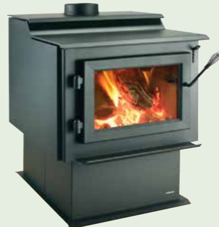
WS22 wood-burning stove