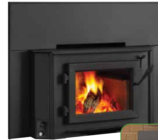
WINS18 wood-burning insert