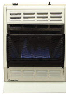
BF10W (10,000 BTUs) BF20W (20,000 BTUs) Both are thermostatically controlled.

Color updated to White. Heater shown on optional stand.