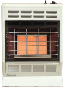
SR18W (18,000 BTUs) SR18TW (18,000 BTUs with thermostat)

Color updated to White. Heater shown on optional stand.