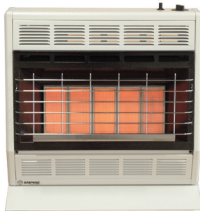
SR30W (30,000 BTUs) SR30TW (30,000 BTUs with thermostat)

Color updated to White. Heater shown on optional stand.