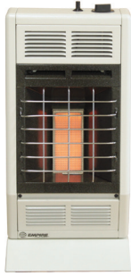
SR6W (6,000 BTUs) SR10W (10,000 BTUs) SR10TW (10,000 BTUs with thermostat)

Color updated to White. Heater shown on optional stand.