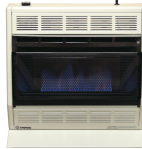
BF30W (30,000 BTUs) Thermostatically controlled.

Color updated to White. Heater shown on optional stand.