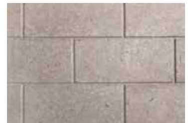
White Stacked Refractory Liner