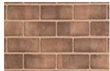
Back Bay Brown Fiber Liner