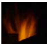
Reflective Black Glass (single-sided only)