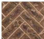
Tavern Brown Herringbone (single-sided only)