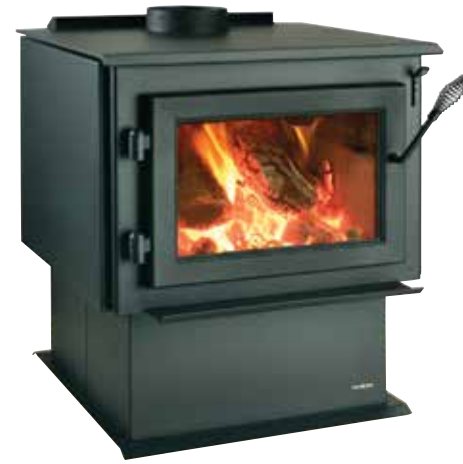
WS18 wood-burning stove

Manufactured in the USA, by the world's leading hearth company since 1927—known for value and dependability.