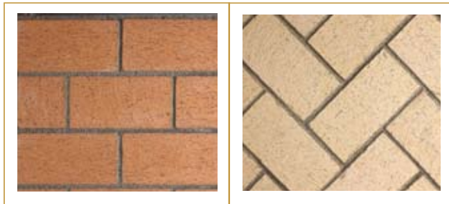
Red "Stacked" Brick

All Mosaic Masonry™ fireplaces come with either Red or Ivory brick in "Stacked" or "Herringbone" patterns.