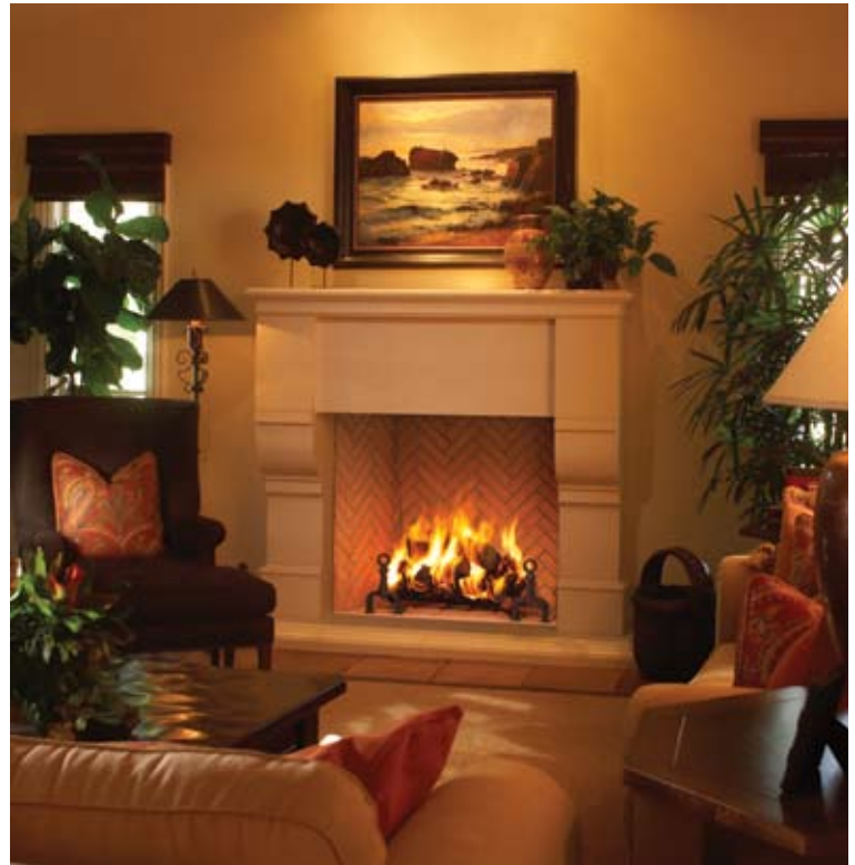
Monticello: Vanguard's Monticello model is 48" wide and has a tall 42" opening. The hearth is only 1 1/2" above the ground for a flush floor finish. The Monticello uses a smaller brick "splits" in its Mosaic Masonry™ in a custom herringbone pattern for an even richer look.

The Mosaic Masonry™ technology uniquely combines that quality appearance of a masonry fireplace with the installation convenience and more reasonable cost of a factory-built fireplace.