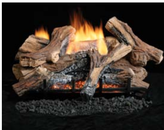
VGC24: Scarlet Oak Vent-Free Gas Logset