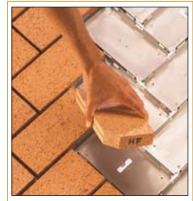
Ivory "Herringbone" Brick

Individual grooved bricks snap-lock securely into stainless steel templates for easy installation. Each firebrick is pre-cut and labeled for location and a perfect result every time.