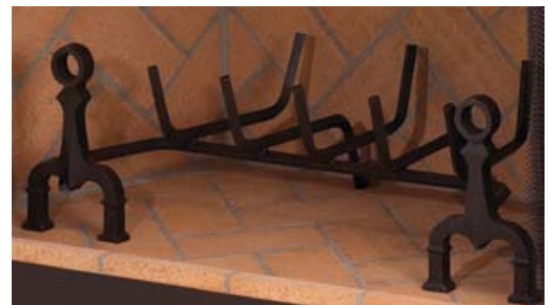
Mosaic Masonry™ Indoor Wood Burning Fireplaces include handsome, hand-finished solid steel log grates with cast iron grate andirons.