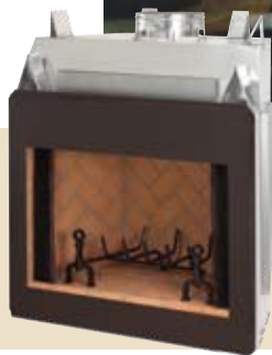
VGM42HR: 42" Winston Wood Burning Fireplace with Red Herringbone Brick