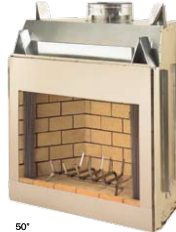
50" Oracle Outdoor Woodburning Fireplace with Ivory Stacked Brick*