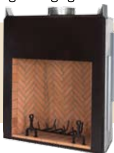
VF48HR: 48" Monticello Wood Burning Fireplace with Red Split Herringbone Brick