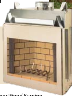
Oracle: This Mosaic Masonry™ Wood Burning Fireplace has been constructed and equipped with stainless steel components for outdoor applications.