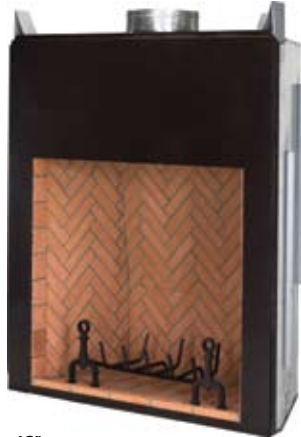
48" Monticello Woodburning Fireplace with Red Herringbone Split Brick