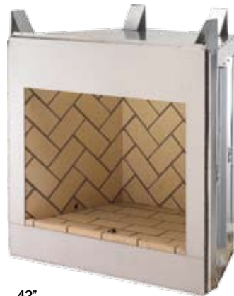
42" Sagamore Outdoor Vent-Free Fireplace with Ivory Herringbone Brick*