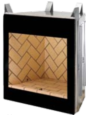
36" Marquee Vent-Free Fireplace with Ivory Herringbone Brick