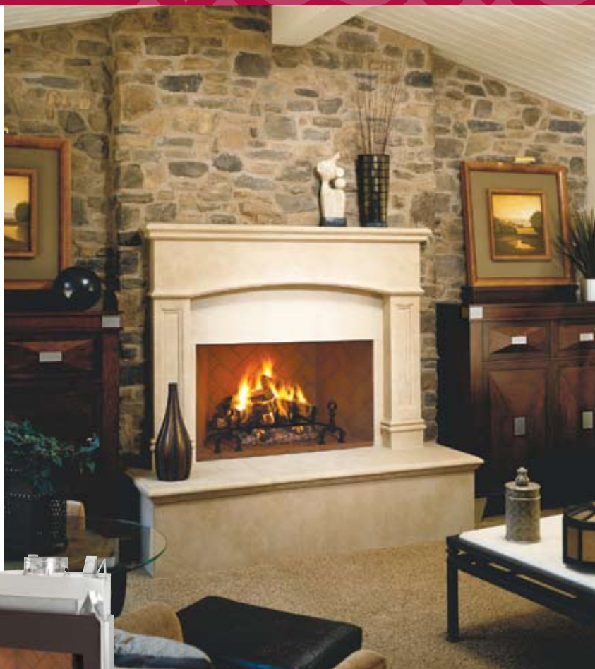
Winston: This Mosaic Masonry™ Wood Burning Fireplace has been constructed and equipped with red herringbone brick.