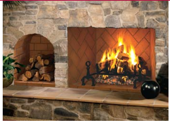
Wood Nook: A “Wood Nook” uses the same Mosaic Masonry™ Technology as the fireplace.