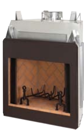
36" Winston Woodburning Fireplace with Red Herringbone Brick