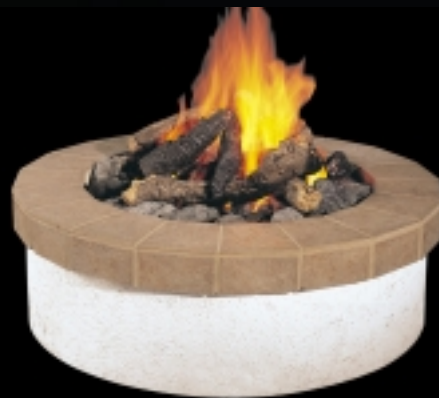
MODEL OC-34TT-BW BEACHWOOD OUTDOOR CAMPFIRE