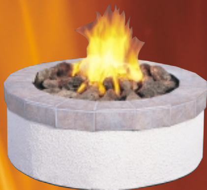
MODEL OC-34TG-C LAVA COAL OUTDOOR CAMPFIRE