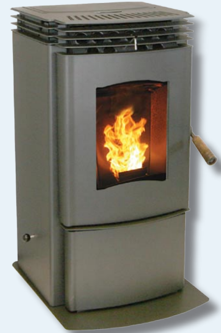
- The Enviro Mini - Small Size, Efficient Heat