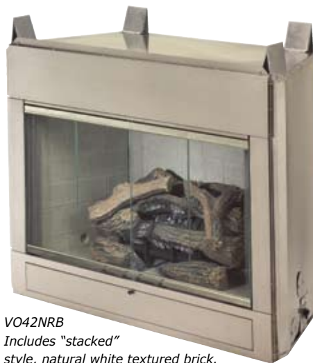
VO42NRB Includes "stacked" style, natural white textured brick.