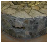
Vents- 2 Total