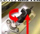
Pilot Hood- turn CCW.