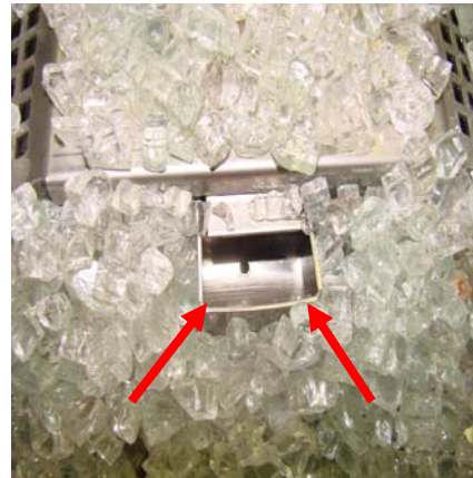
DO NOT COVER PILOT OPENING!